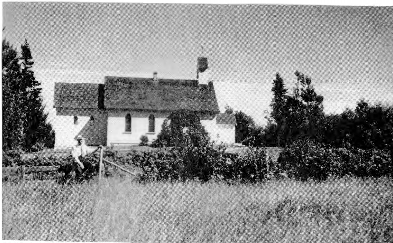
ST. PAUL'S - PERCÉ